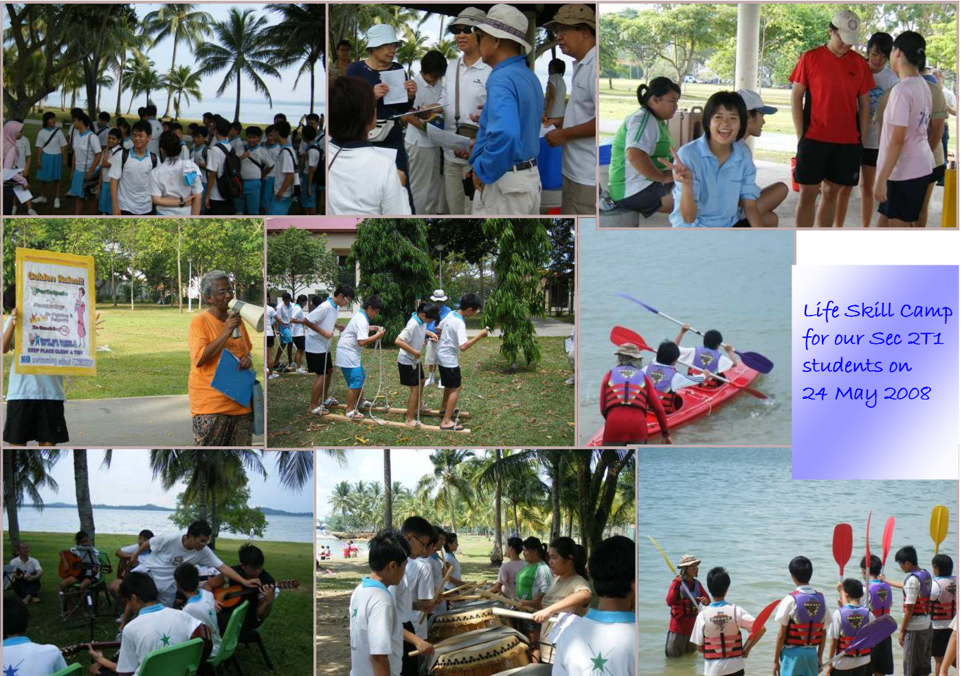
Life Skill camp for our Sec 2T1 students on 24 May 2008