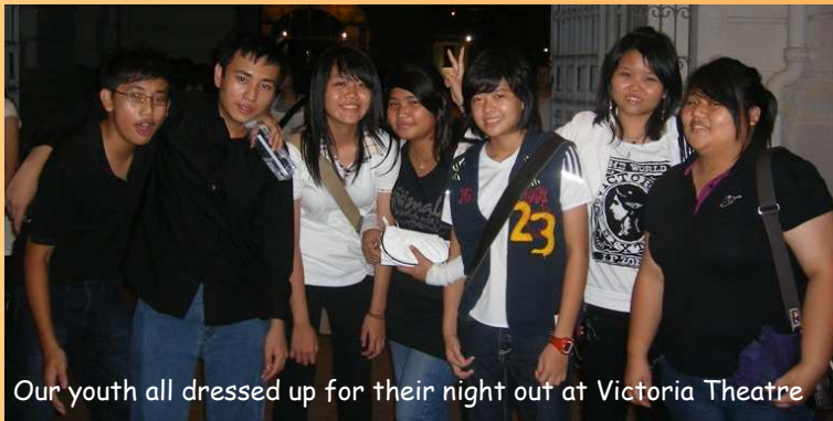
Our youth all dressed up for their night out at Victoria Theatre