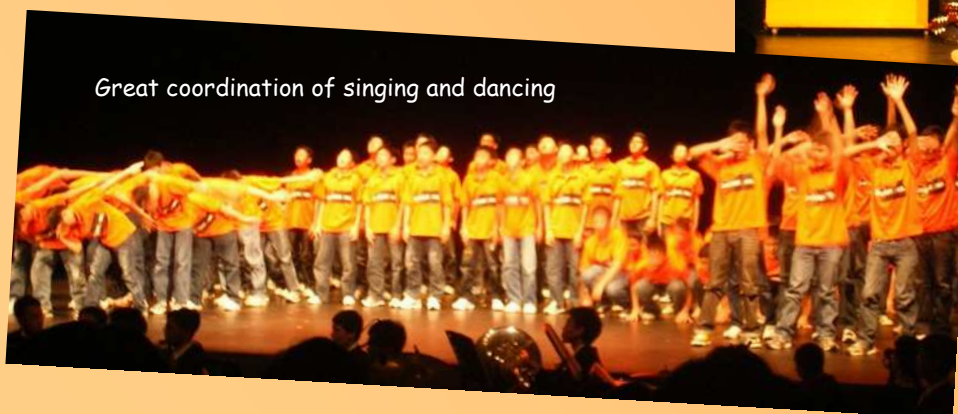
Great coordination of singing and dancing