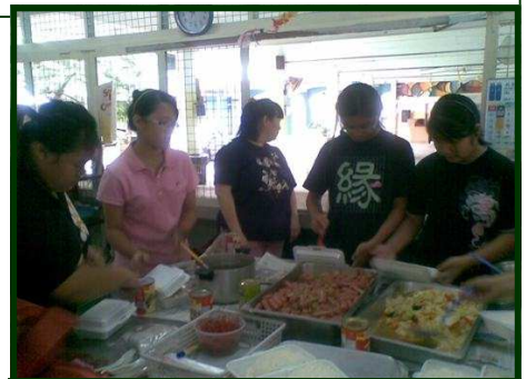
Packers in action