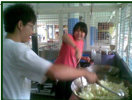
I can handle a frying wok...