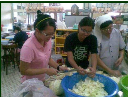
Happily cutting cabbage leaves

All of them learned fast with readiness to listen and do. And the distribution of food was well on time for the migrant construction workers !